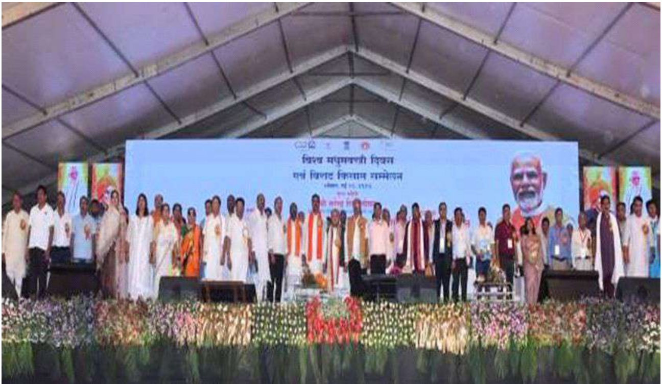
World Bee Day (WBD) was celebrated under the gracious presence of Hon'ble Minister of Agriculture & Farmers Welfare, Government of India on 20 th May, 2023 at College of Agriculture, Waraseoni, Balaghat, Madhya Pradesh.