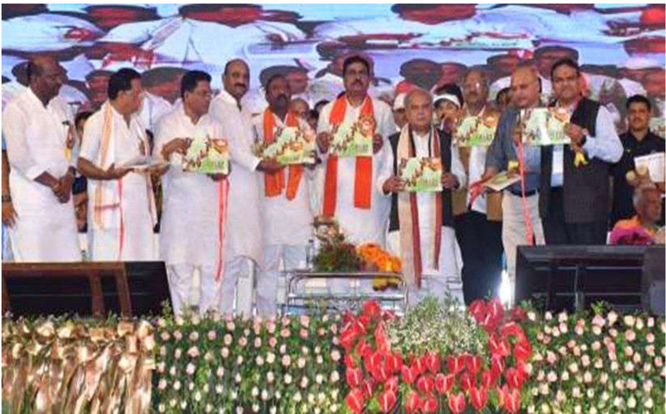
Launching of Book (Marching Towards Sweet Revolution under NBHM Scheme during World Bee Day (WBD) by the Hon'ble Minister of Agriculture & Farmers Welfare, Government of India on 20 th May, 2023 at College of Agriculture, Waraseoni, Balaghat, Madhya Pradesh