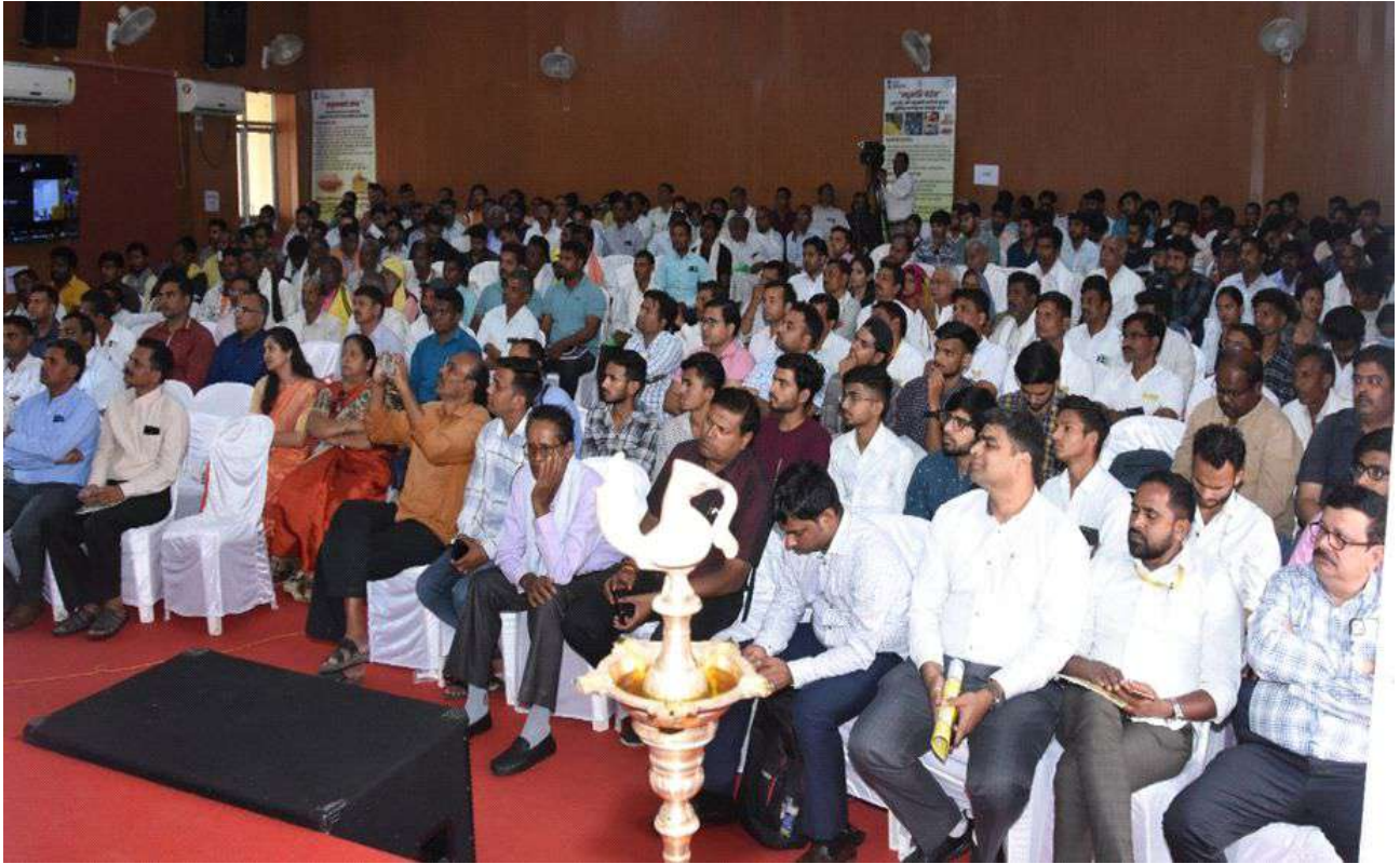
National Workshop on “Technology Intervention in Beekeeping Sector” was organized on 19 th April 2023 under the Chairmanship of Additional Secretary (AL), DA&FW at Central Farm Machinery Training & Testing Institute, Budni, Madhya Pradesh