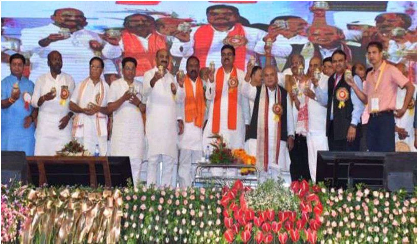
Launching of Purabi Honey during World Bee Day (WBD) by the Hon'ble Minister of Agriculture & Farmers Welfare, Government of India on 20 th May, 2023 at College of Agriculture, Waraseoni, Balaghat, Madhya Pradesh