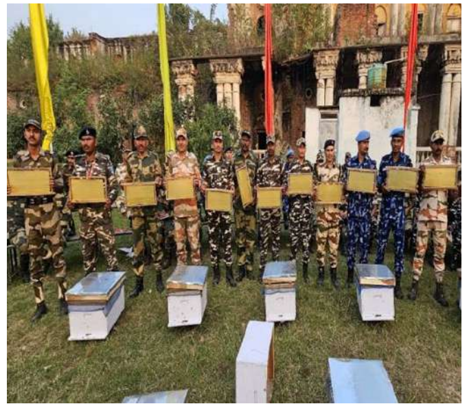
Four days training Programme conducted on “Scientific Beekeeping for CAPFs and officials” at Jalpaiguri, West Bengal during 26 th October- 9 th December 2023.