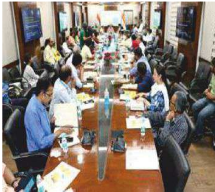
Consultative Workshop on “Technological Intervention & Innovations in the Honey / Beekeeping Sector” was organized on 12 th April 2023 under the Chairmanship of Additional Secretary (AL), DA&FW at Krishi Bhawan in New Delhi under National Beekeeping & Honey Mission (NBHM)