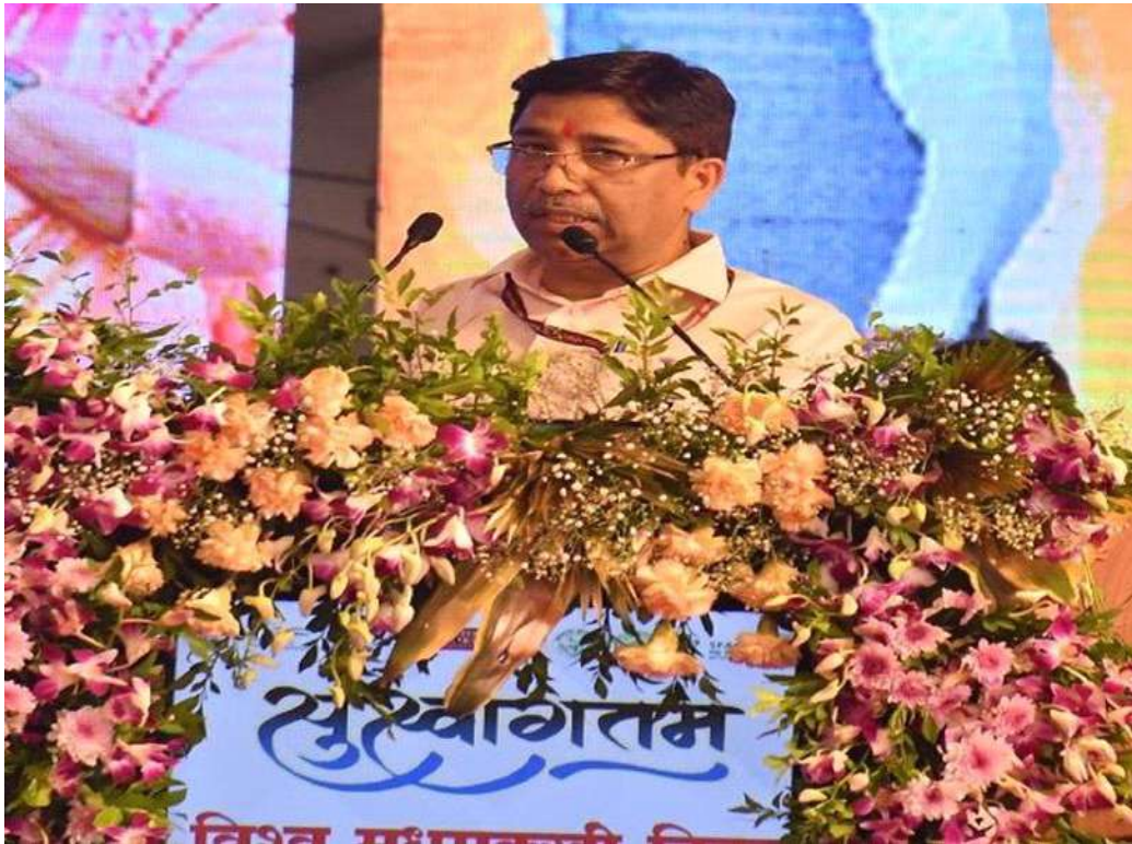
World Bee Day (WBD) was celebrated under the gracious presence of Horticulture Commissioner, Ministry of Agriculture & Farmers Welfare, Department of Agriculture and Farmers Welfare, Government of India on 20 th May, 2023 at College of Agriculture, Waraseoni, Balaghat, Madhya Pradesh.