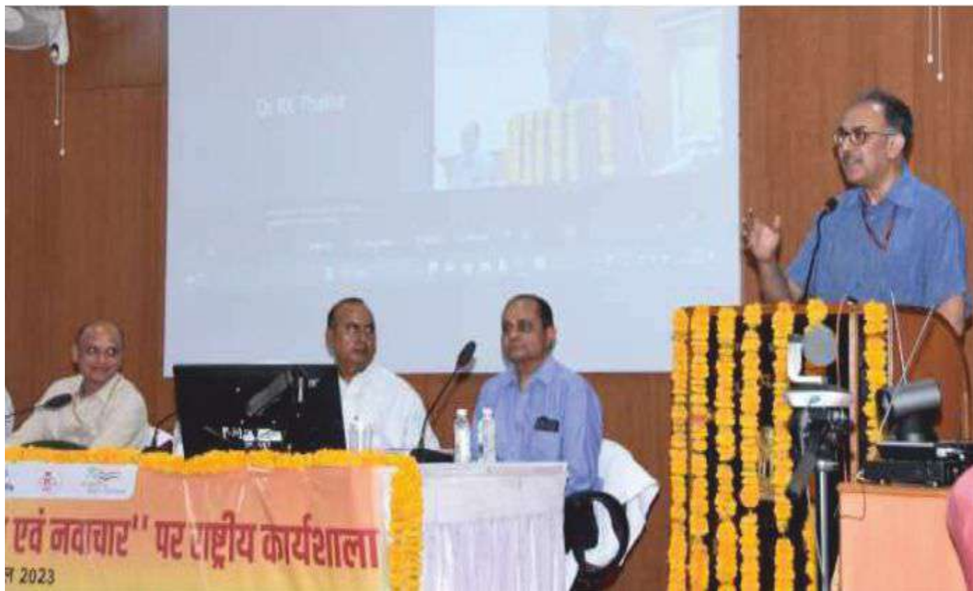
National Workshop on “Technology Intervention in Beekeeping Sector” was organized on 19 th April 2023 under the Chairmanship of Additional Secretary (AL), DA&FW at Central Farm Machinery Training & Testing Institute, Budni, Madhya Pradesh