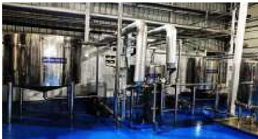
Established a Honey & other beehive Processing Unit under NBHM Scheme at Salt Range Foods Private Limited. Guwahati, Assam

Honey production has seen a substantial growth in the last decade, with the support of the NBHM mission, which has support in boosting the honey production, adopting modern technology & scientific methods in avoiding adulteration in honey, which has helped to increase exports of honey and allied products to boost the sector