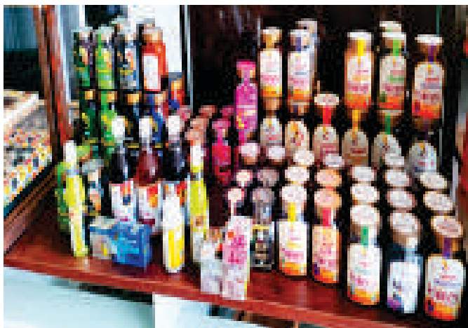
A range of Honey & other value-added products on Beekeeping manufactured by Hi-Tech Natural Products (India) Ltd. under NBHM scheme