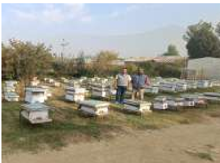
Bee colonies maintained by Sher-e-Kashmir University of Agricultural Sciences and Technology, Sri-Nagar Under NBHM scheme