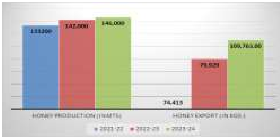
Production & Export of Honey during last 3 years (2021-22 to 2023-24)