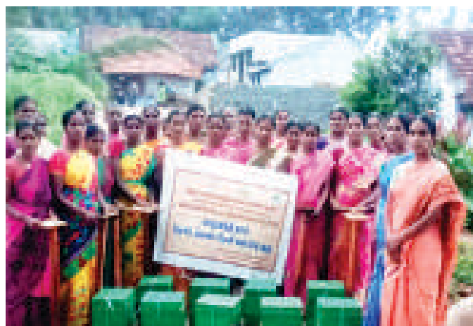
Activities of Women SHG Groups across multiple districts – Tamil Nadu Horticulture Development Agency under NBHM scheme