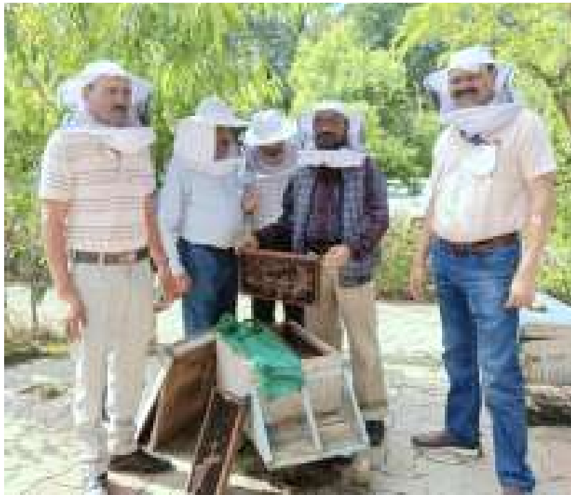
Demonstration of bee colonies at Honeybee Research station, Nagrota, CSK Himachal Pradesh