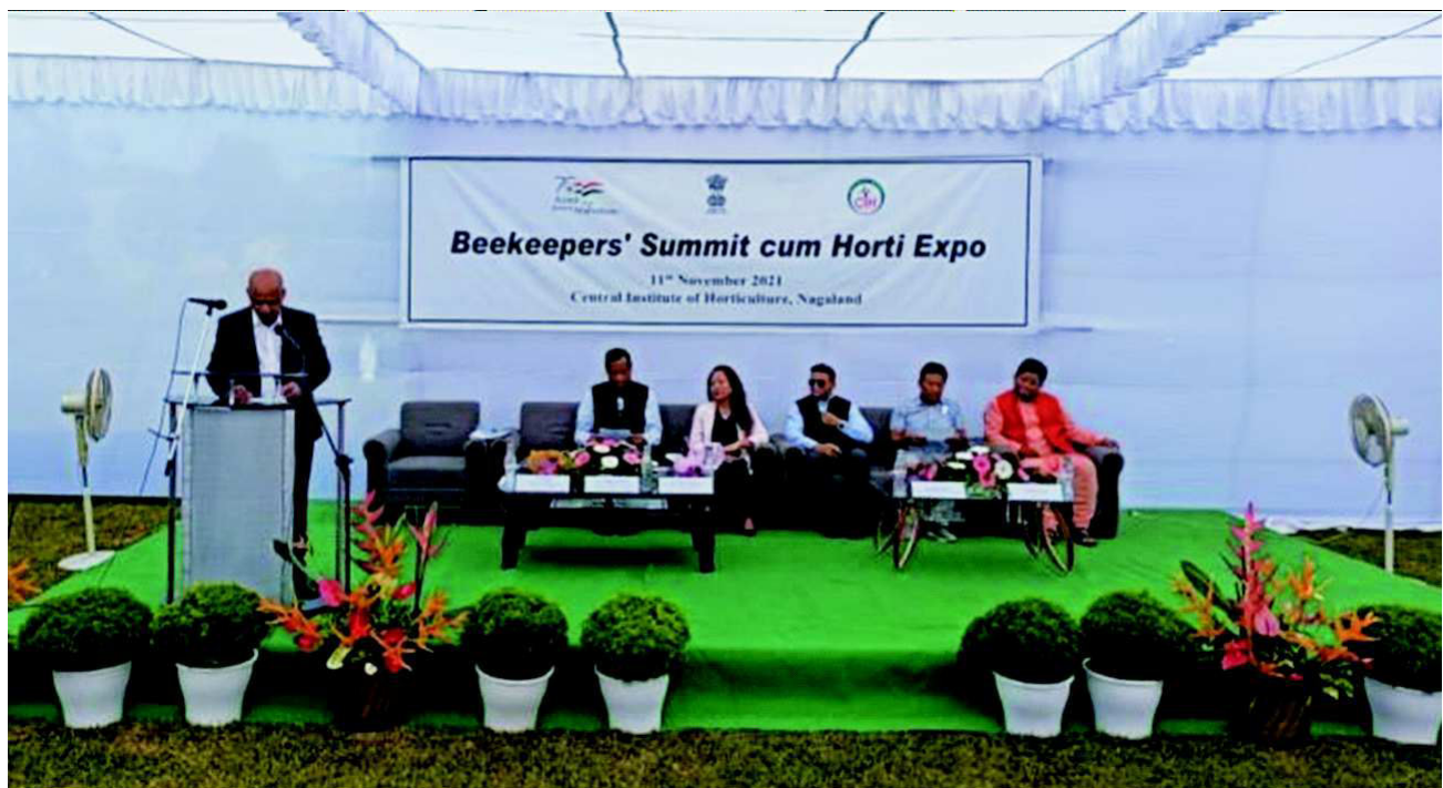
Inauguration of Beekeepers Summit and Farmers' Hostel at Central Institute of Horticulture (CIH), Nagaland by Hon'ble Union Minister of Agriculture & Farmers Welfare, Govt. of India on 11.11.2021 at IARI, Pusa, New Delhi through virtual mode.