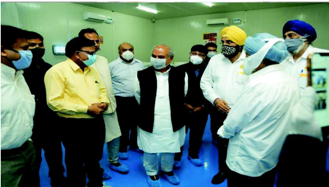
Inauguration of Honey & other beehive product Processing Lab by Hon'ble Minister of Agriculture & Farmers Welfare, Golat Kamrup, Assam on 04.10.2021 sanctioned under National Beekeeping and Honey Mission (NBHM).