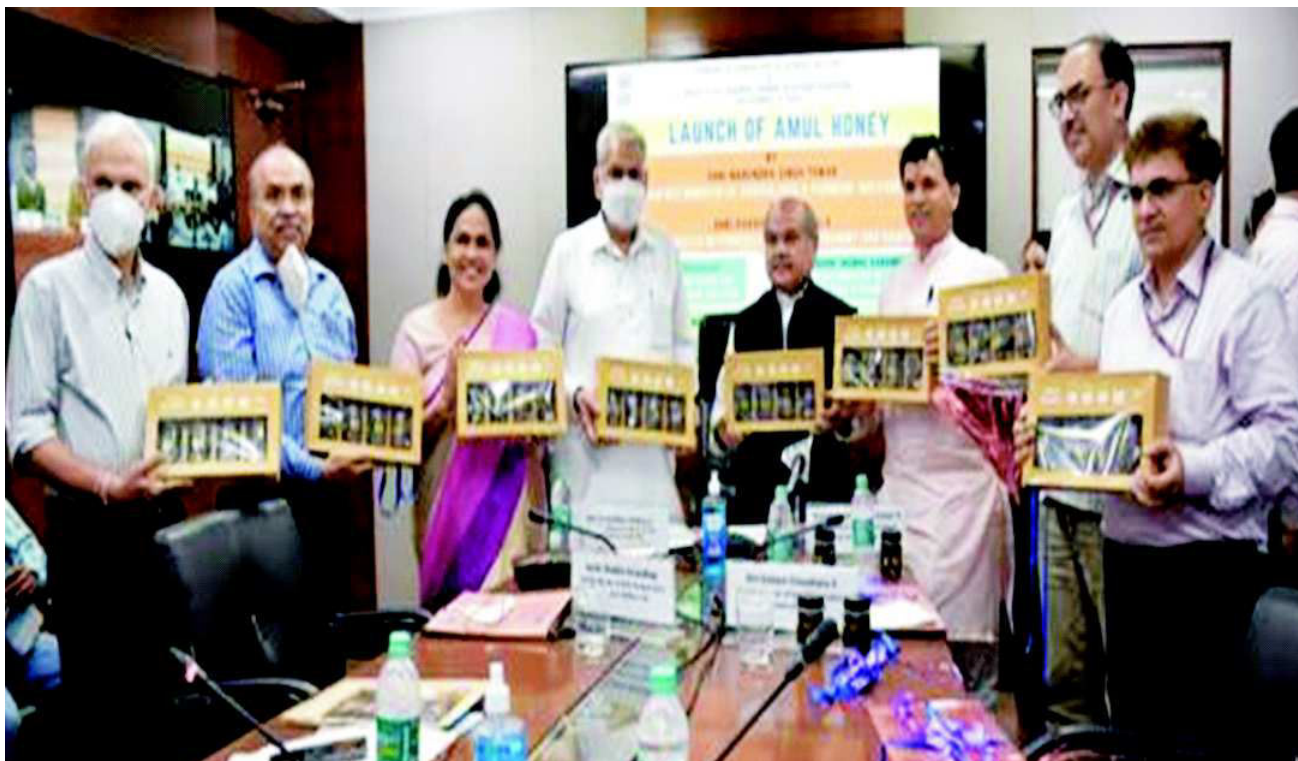
Launching of Amul Honey' by Shri Narendra Singh Tomar Ji, Hon'ble Union Minister of Agriculture & Farmers Welfare in the presence of Shri Parshottam Rupala, Hon'ble Union Minister for Animal Husbandry, Fisheries and Dairying on 28.09.2021 under National Beekeeping and Honey Mission (NBHM).